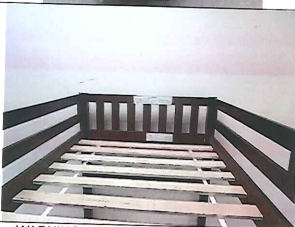
WARNING & TRACKING LABEL POSITION