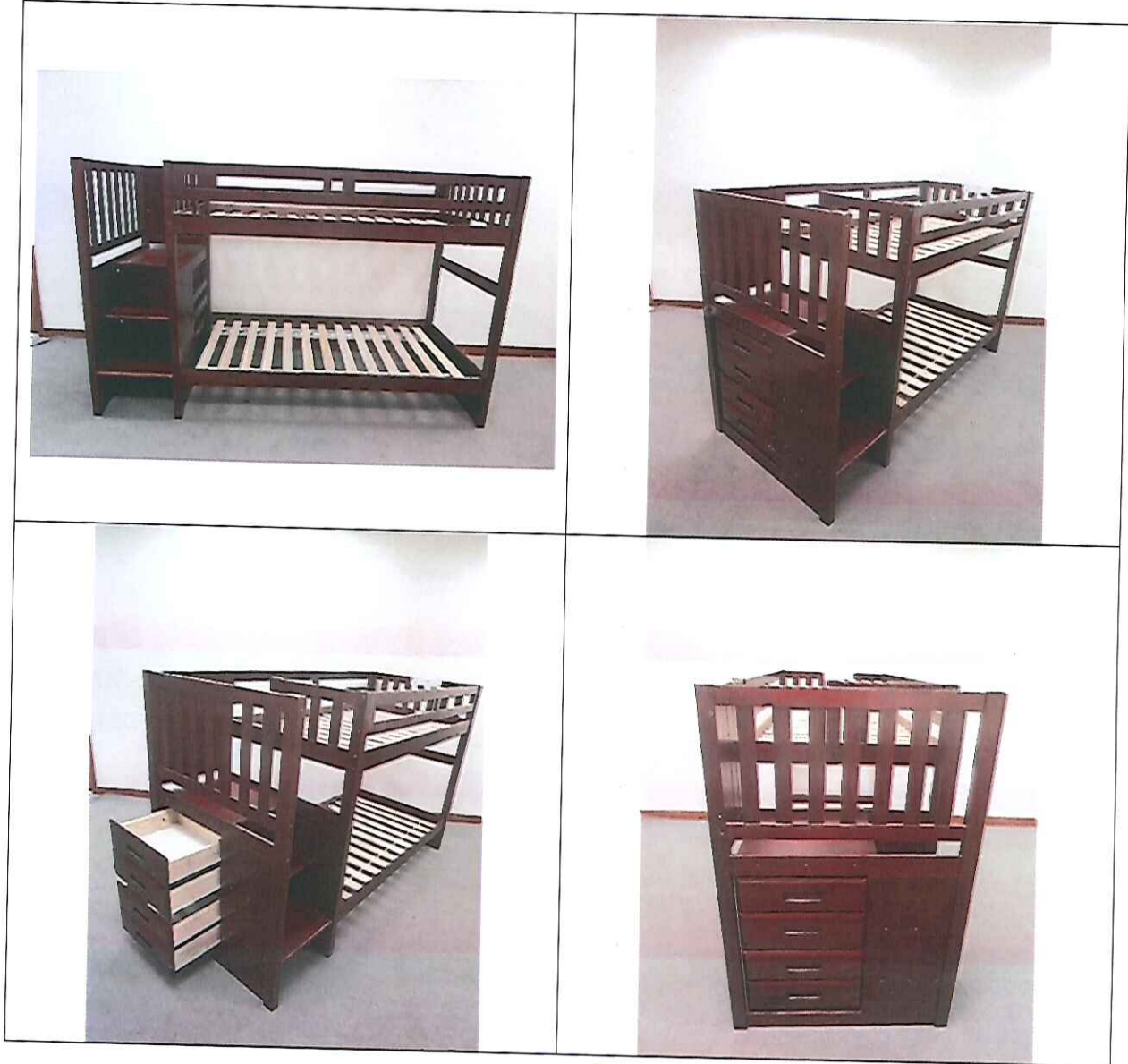
PHOTO OF SUBMITTED SAMPLE FOR TESTING