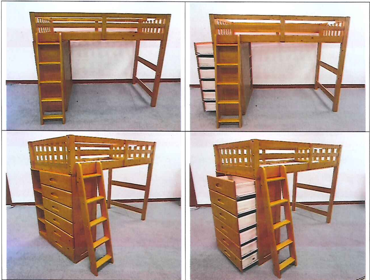
PHOTO OF SUBMITTED SAMPLE FOR TESTING